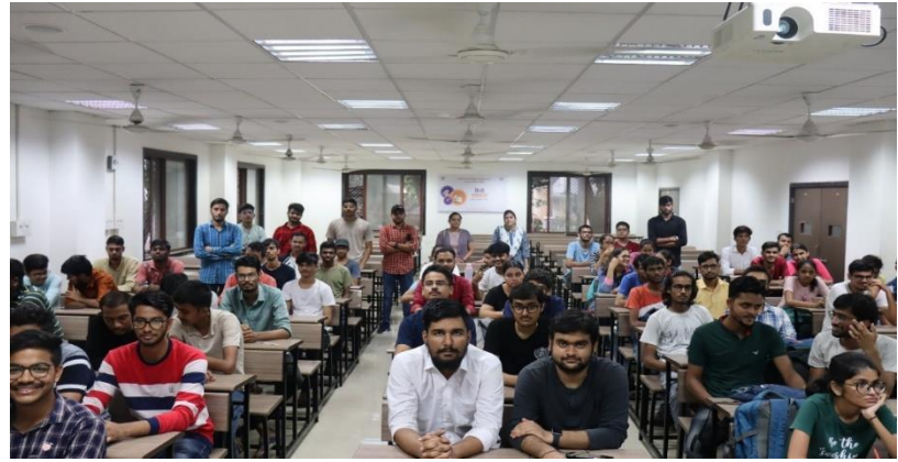
Organization of Hindi Quiz Competition for students during Hindi Fortnight-2023