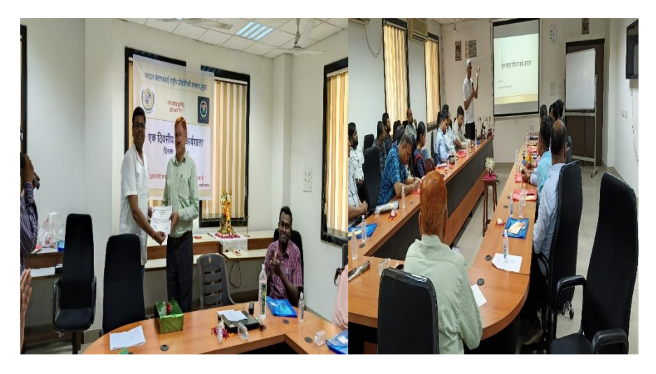
Hindi workshop organisation 29th April-2024