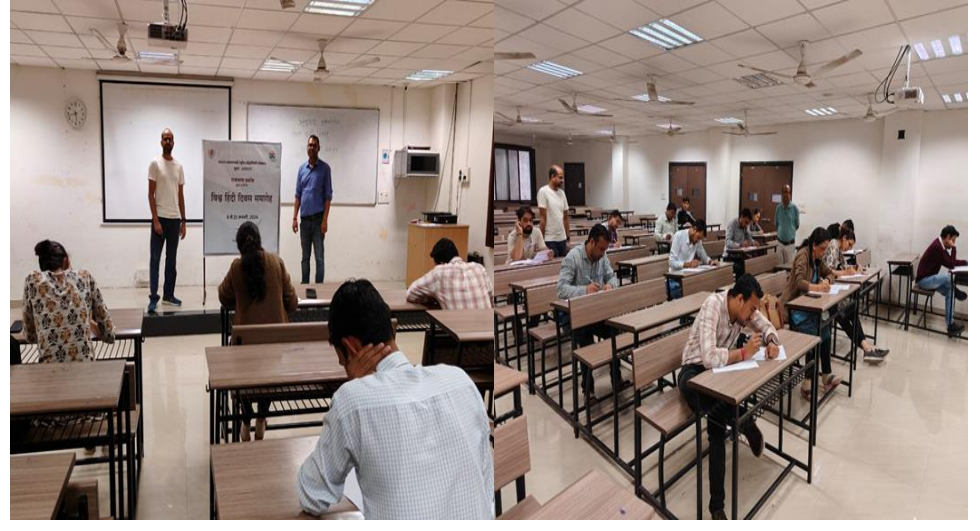
English Hindi Translation competition during World Hindi Day events on 11th January-2024

In January, 2024, World Hindi Day event was organized by Hindi cell during 1-15 January, 2024. In this event many Hindi related programs and Hindi competitions were organized for employees and students of the Institute. Hindi quiz, Hindi paragraph writing and Hindi book exhibition English-Hindi translation competition and Hindi essay writing competition were organized. In February, 2024, International Native Language week was observed during 20-28th February 2024. Many events like Panel discussion in Hindi, Signature campaign in native language etc. were organized this duration.