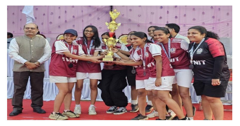
SVNIT Surat at Inter-NIT Football Women's Tournament 2023-24

SVNIT Surat Football Women's team played 3 draw matches against NIT Calicut, NIT Delhi and NIT Durgapur in league round. With goal difference among all teams were compared and NIT Surat qualified for Semi-final match against the NIT Rourkela. The SVNIT Surat ended its journey with third position against NIT Jamshedpur.