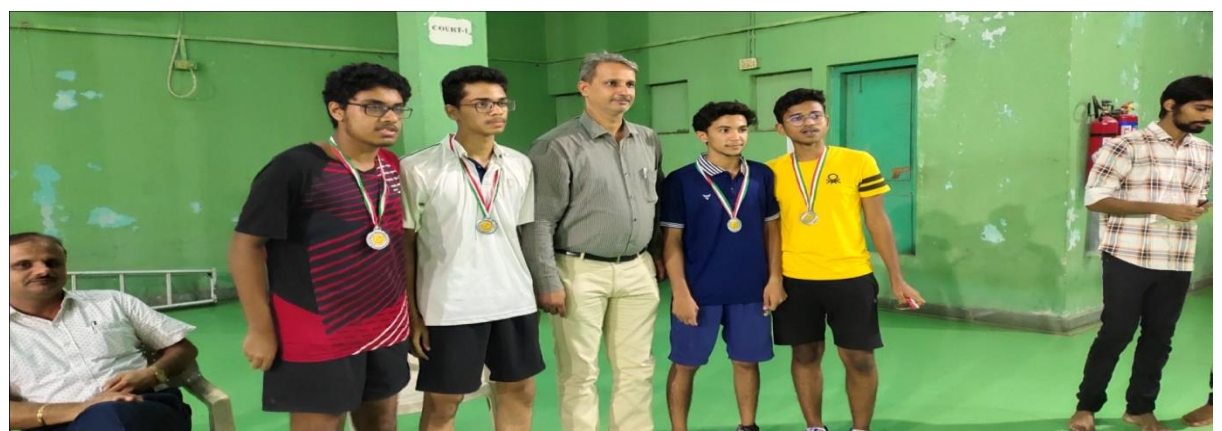
PRIZE DISTRIBUTION OF INTER YEAR BADMINTON TOURNAMENT,2022