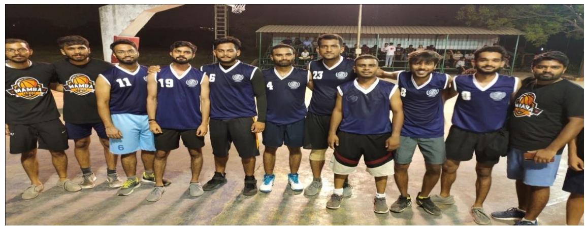
INTER YEAR BASKETBALL TOURNAMENT- 2022-23