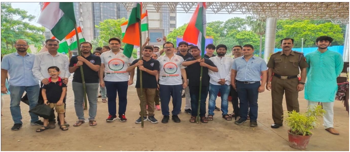
HAR GHAR TIRANGA RALLY, 2022