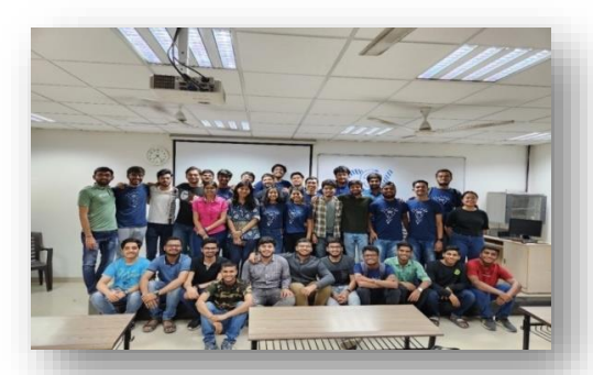
Polygon Guild Building Blocks Workshop