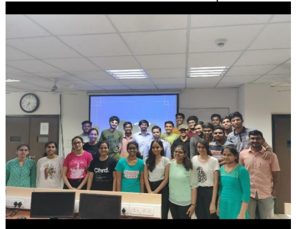
Game development using AI and Scratch